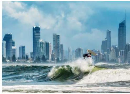
Charms: Burleigh Beach; Pandanus; local treats

the seriously well-appointed kitchen, kitted out with high-quality everything including chef's knives and dishwasher. We're only here for the weekend, though, and everyone's been talking about the transformation of the wining and dining scene at our doorstep.