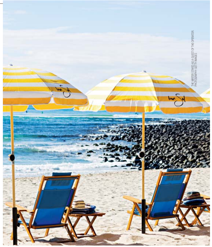
THE WRITER STARED AS A QUEST OF THE OPERATOR.

Thoughtful touches throughout the apartment include beach towels, hairdryers, toiletries, not one but two Cloud Nine hair defrizzers, Bang & Olufsen sound, three big TVs and a washer/dryer. But in a brand new fit-out, the lack of a USB port is a little disappointing and the noisy bathroom fan needs a rethink. Longer-stay guests will appreciate